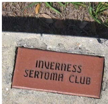
The Lawn Crew removed weeds from our Clubs " Sidewalk Marker "